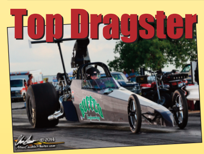
Top Dragster must qualify and dial quicker than 5.90 (1/8th mile)

12 Car Qualified Field for both Top Dragster & Top Sportsman