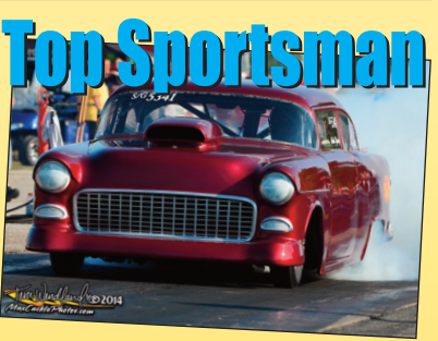
Top Sportsman must qualify and dial quicker than 6.50 (1/8th mile)

Non-Qualifiers will run in gambler's race for 100% payback.