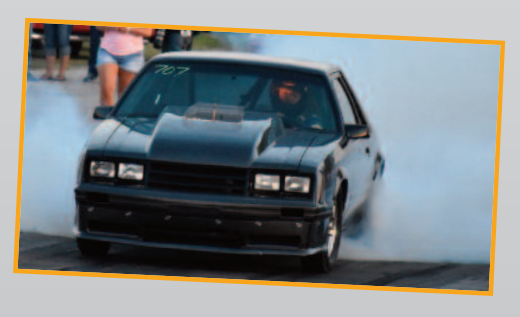
REIL RICING! REIL SPEED!

Saturday: Gates open 10 am • Racing starts 11 am • Jet 8 pm • Altereds 5, 7 & 9 pm Sunday: Gates open 10 am • Racing starts 11 am • Jet 7 & 9 pm